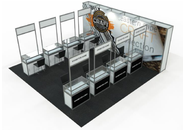
Sample of the proposed stand look.